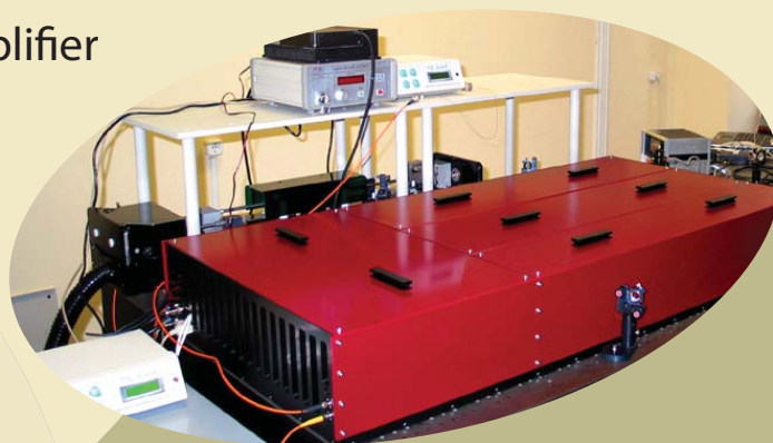
Cr:Forsterite regenerative amplifier Cortes-200